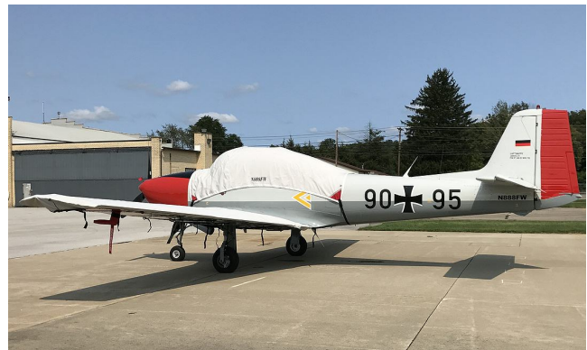
Focke Wulf F149 Canopy Cover, Wing Covers