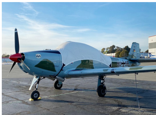
Focke Wulf 149 Trainer Canopy Cover

of the Canopy Cover and Engine Cover. This cover will enclose the engine cowl and will extend aft to cover all of the windows. This cover type is made from Silver Acrylic Sunbrella canvas and is 100% lined with a soft and smooth microfiber. Bruce's Custom Covers developed this material combination especially for aircraft protection. The outer material is medium weight and treated for water resistance, UV resistance and anti-static buildup. The inner lining is a very soft and smooth microfiber to prevent scratching. The material is very reflective, and tests show that the cabin interior temperature can be reduced to near-ambient temperature on the hottest of days. It is water, ice and snow repellent, yet breathable to allow moisture to escape from between the cover and the aircraft surface.