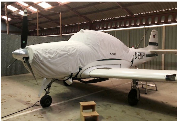
Piaggio FW-149D Canopy/Engine Cover

of the Canopy Cover and Engine Cover. This cover will enclose the engine cowl and will extend aft to cover all of the windows. This cover type is made from Silver Acrylic Sunbrella canvas and is 100% lined with a soft and smooth microfiber. Bruce's Custom Covers developed this material combination especially for aircraft protection. The outer material is medium weight and treated for water resistance, UV resistance and anti-static buildup. The inner lining is a very soft and smooth microfiber to prevent scratching. The material is very reflective, and tests show that the cabin interior temperature can be reduced to near-ambient temperature on the hottest of days. It is water, ice and snow repellent, yet breathable to allow moisture to escape from between the cover and the aircraft surface.