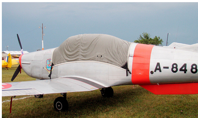
Piaggio P-149D Trainer Canopy Cover