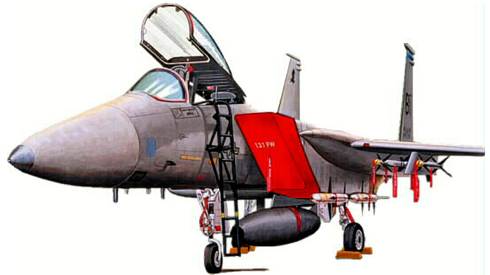
F15 Cockpit HeatShields & Inlet Cover