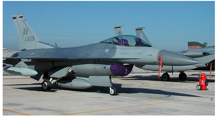
Intake, Maintenance Seat & HUD display covers (Aviano AFB)