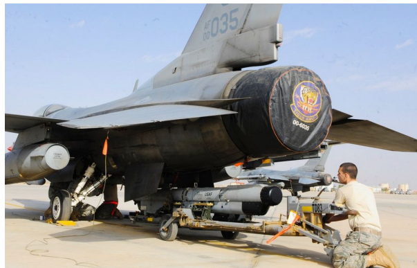
General Dynamics F-16 Fighting Falcon Exhaust Cover