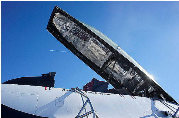
F-16 Cockpit HeatShields

Cockpit Heatshields are interior sunshades for the aircraft's cockpit. The product is a unique composite of closed-cell foam with a silver mylar finish. The semi-rigid design is stiff enough to stand inside the window framing. The set folds up flat and is easily stored in the included storage sleeve. Some designs may require velcro and suction cups. Our Heatshields for jets are offered white side out because some aircraft manufacturers have issued advisories against reflective window inserts due to potential heat damage. A Heatshield is an excellent short-term remedy for cockpit overheating, but an external fabric cover is more effective for long-term protection.