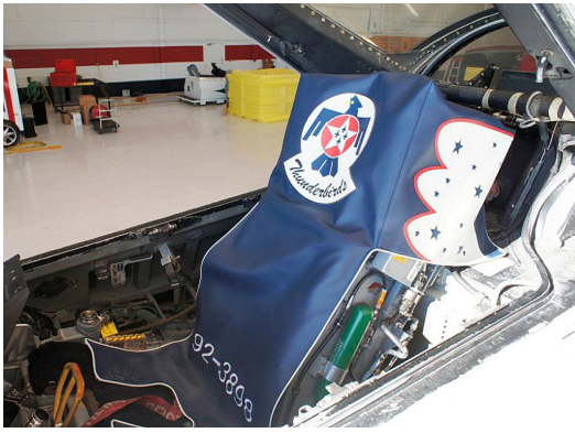
Acres II Maintenance Seat Cover w/ custom art and design