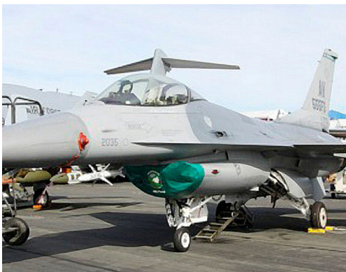
F-16 Intake Cover

The Engine Inlet Plugs are custom fit for your General Dynamics F-16 Fighting Falcon intakes, made with heavy-duty vinyl material, and stuffed with a single block of sculpted urethane foam. Each plug has a zipper that allows the foam to be removed and dried if necessary. Engine plugs have 'remove before flight' streamers sewn onto the face of the plugs. Most plugs are imprinted with the aircraft registration number in black for an extra charge. Storage bag NOT included. Engine plugs may be inserted after flight when the engine is still warm. Engine Inlet Plugs are commonly referred to as Cowl Plugs, Intake Plugs, Cowl Blocks, Engine Blocks, and Engine Bungs.