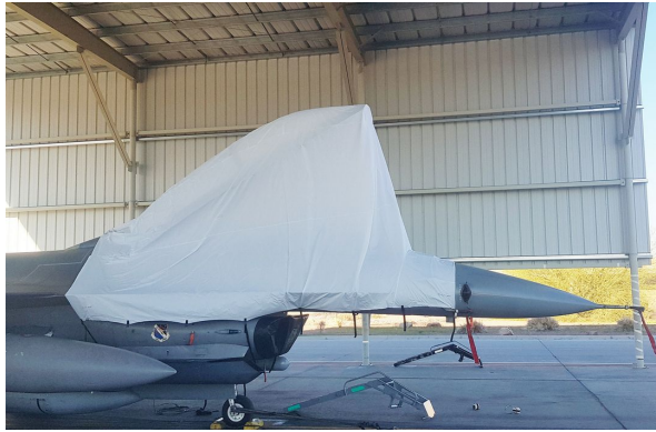
McDonnell Douglas F16-D Canopy Cover, open cockpit type (test fit cover)

This cover type is made from Silver Acrylic Sunbrella canvas and is 100% lined with a soft and smooth microfiber. Bruce's Custom Covers developed this material combination especially for aircraft protection. The outer material is medium weight and treated for water resistance, UV resistance and anti-static buildup. The inner lining is a very soft and smooth microfiber to prevent scratching. The material is very reflective, and tests show that the cabin interior temperature can be reduced to near-ambient temperature on the hottest of days. It is water, ice and snow repellent, yet breathable to allow moisture to escape from between the cover and the aircraft surface.