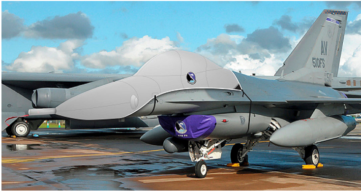
F-16 Canopy/Nose Cover

Travel Covers are made with Silver Solution-Dyed Polyester fabric and only lined over the windshield to save weight. The material is lightweight and more compact for easy stowage in the aircraft. The polyester material is water resistant, but only intended for occasional use outside. We also have an ultra lightweight material available for fitted hangar dust covers. For daily outdoor use, the non-travel Sunbrella Cover is the best choice.