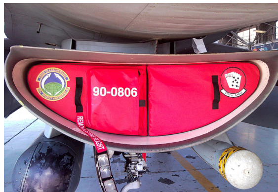
F-16 Folding Intake Plug with Forms Pouch and Custom Artwork