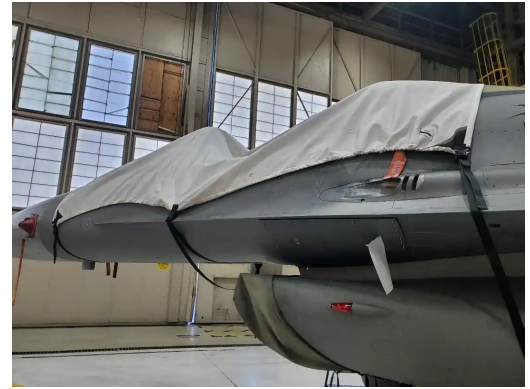
F-16 C-Model Single Seat Canopy Cover Open Position