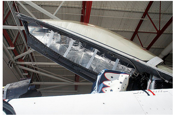
F-16 Cockpit HeatShields and Maintenance Seat Cover