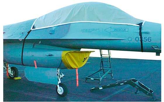
Canopy Cover, F-16