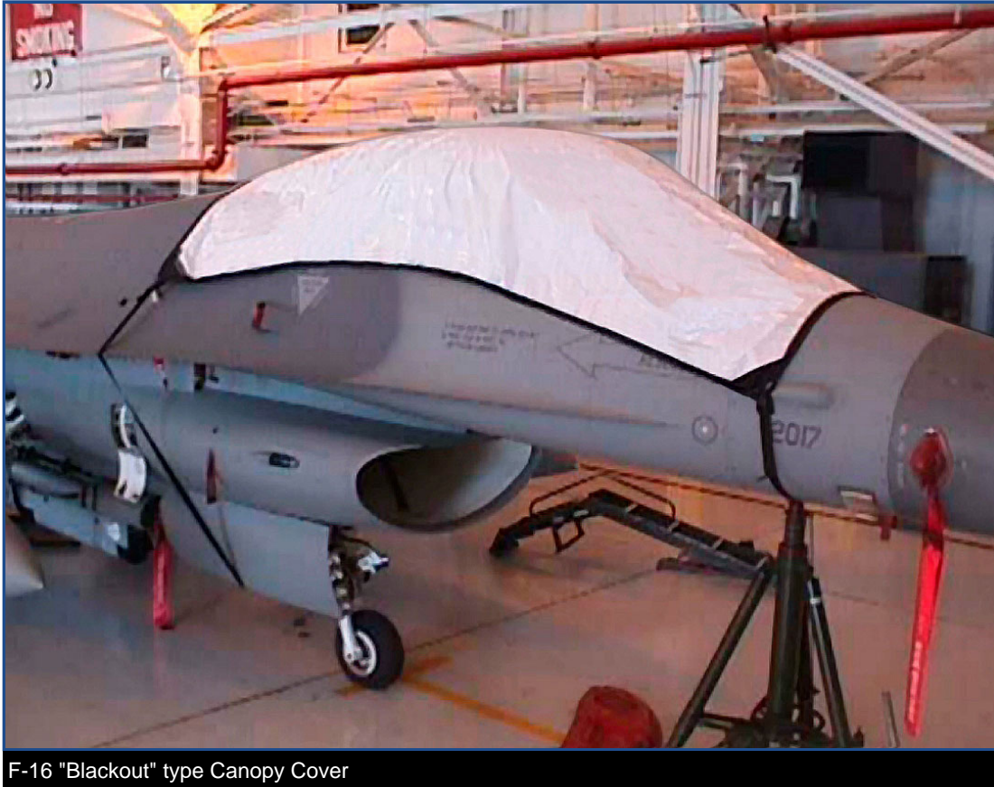
F-16 "Blackout" type Canopy Cover