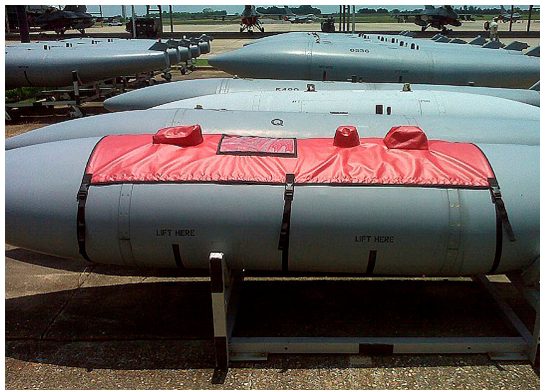
300 gal. CENTERLINE FUEL TANK PYLON COVER, with/without forms pouch

WINTER USE MATERIAL - Made with Solution-Dyed Polyester fabric, this option is intended for seasonal use to aid in deicing, rain mitigation, or for occasional travel. The material is lighter and more compact, but more susceptible to UV damage and may have a shorter useful life if used continuously outside than the all-year use material.