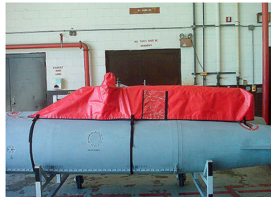
370 gal. WING FUEL TANK PYLON COVER, with/without forms pouch