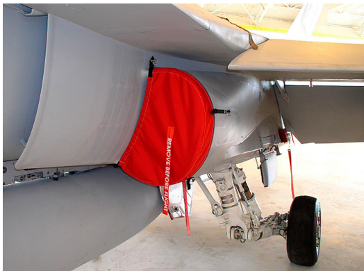
F-18 Engine Inlet Cover

The McDonnell Douglas F-18 Hornet, Super Hornet Intake Covers are designed to install easily yet be completely storable. A spring steel hoop is sewn into the hem of each cover, allowing them to be installed without climbing onto the wing or using a stepladder. To store the covers the spring steel hoop folds like a band-saw blade into three nesting rings. Each cover folds into a compact circular bundle which is stored in the included duffle bag, yet they unfold quickly for use. The Tri-Fold Ring cover is made of medium weight nylon which is available in a variety of colors to match the paint trim. Each cover set comes complete with installation and folding instructions. The aircraft's registration number can be silkscreened onto the cover for an extra charge.