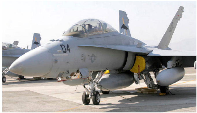
F-18 Intake Cover Set