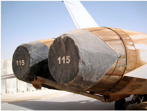
F-18 Exhaust Covers

The McDonnell Douglas F-18 Hornet, Super Hornet Intake Covers are designed to install easily yet be completely storable. A spring steel hoop is sewn into the hem of each cover, allowing them to be installed without climbing onto the wing or using a stepladder. To store the covers the spring steel hoop folds like a band-saw blade into three nesting rings. Each cover folds into a compact circular bundle which is stored in the included duffle bag, yet they unfold quickly for use. The Tri-Fold Ring cover is made of medium weight nylon which is available in a variety of colors to match the paint trim. Each cover set comes complete with installation and folding instructions. The aircraft's registration number can be silkscreened onto the cover for an extra charge.