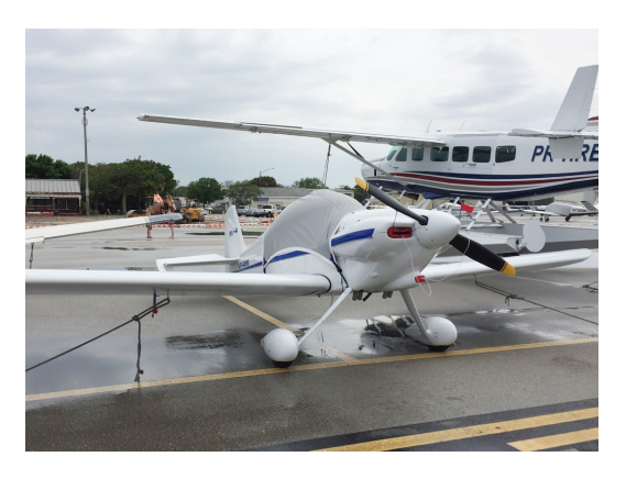
F1 Rocket Travel Cover, Light Weight Travel Canopy Cover, Bubble Windshield, Engine Plugs