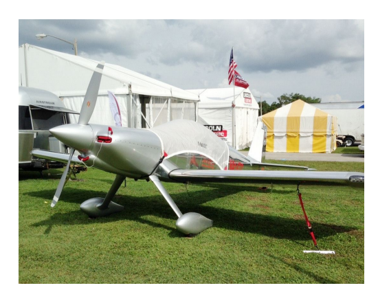
F1 Rocket Canopy Cover, Engine Plugs