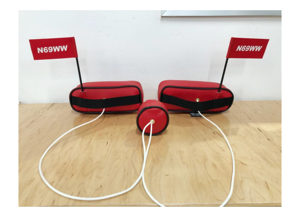
F1 Rocket Engine Plugs too small to imprint on plugs

Engine Inlet Plugs are custom fit for your Team Rocket F1 Rocket intakes, made with heavy-duty vinyl material, and stuffed with a single block of sculpted urethane foam. Each plug has a zipper that allows the foam to be removed and dried if necessary. Engine plugs have warning flags that are visible from the cockpit or 'remove before flight' streamers sewn onto the face of the plugs. Most plugs are imprinted with the aircraft registration number in black for an extra charge. Storage bag NOT included. Engine plugs may be inserted after flight when the engine is still warm. Engine Inlet Plugs are commonly referred to as Cowl Plugs, Intake Plugs, Cowl Blocks, Engine Blocks, and Engine Bungs.