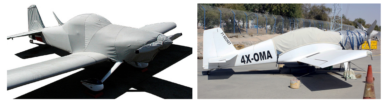
Van's RV-4 Complete Cover

This cover type is made from Silver Acrylic Sunbrella canvas and is 100% lined with a soft and smooth microfiber. Bruce's Custom Covers developed this material combination especially for aircraft protection. The outer material is medium weight and treated for water resistance, UV resistance and anti-static buildup. The inner lining is a very soft and smooth microfiber to prevent scratching. The material is very reflective, and tests show that the cabin interior temperature can be reduced to near-ambient temperature on the hottest of days. It is water, ice and snow repellent, yet breathable to allow moisture to escape from between the cover and the aircraft surface.