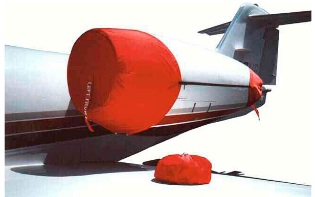
Lear 30 Tri-Fold Engine Cover