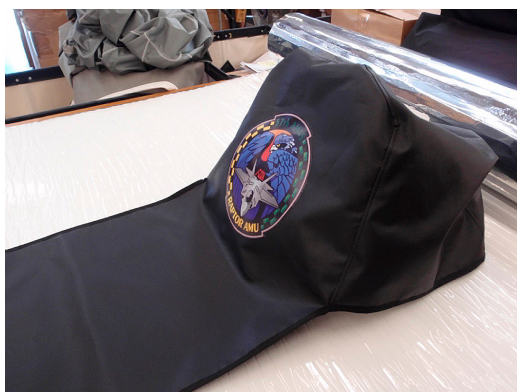
F22 Raptor Ejection Seat Maintenance Cover

The Engine Inlet Plugs are custom fit for your Lockheed Martin/Boeing F-22 Raptor intakes, made with heavy-duty vinyl material, and stuffed with a single block of sculpted urethane foam. Each plug has a zipper that allows the foam to be removed and dried if necessary. Engine plugs have 'remove before flight' streamers sewn onto the face of the plugs. Most plugs are imprinted with the aircraft registration number in black for an extra charge. Storage bag NOT included. Engine plugs may be inserted after flight when the engine is still warm. Engine Inlet Plugs are commonly referred to as Cowl Plugs, Intake Plugs, Cowl Blocks, Engine Blocks, and Engine Bungs.