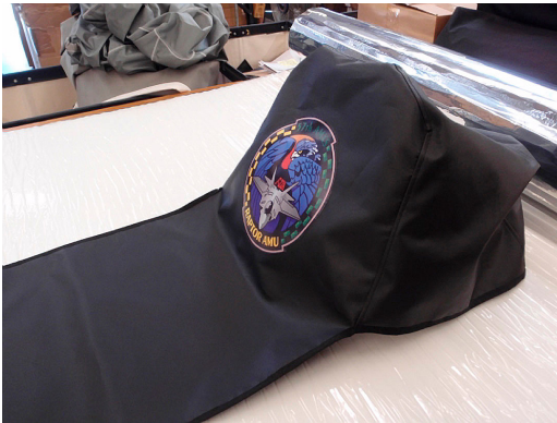
F22 Raptor Ejection Seat Maintenance Cover