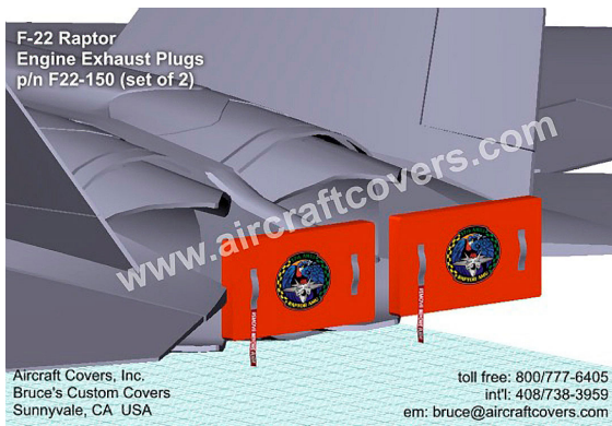
F-22 Exhaust Plugs, illustration

The Engine Inlet Plugs are custom fit for your Lockheed Martin/Boeing F-22 Raptor intakes, made with heavy-duty vinyl material, and stuffed with a single block of sculpted urethane foam. Each plug has a zipper that allows the foam to be removed and dried if necessary. Engine plugs have 'remove before flight' streamers sewn onto the face of the plugs. Most plugs are imprinted with the aircraft registration number in black for an extra charge. Storage bag NOT included. Engine plugs may be inserted after flight when the engine is still warm. Engine Inlet Plugs are commonly referred to as Cowl Plugs, Intake Plugs, Cowl Blocks, Engine Blocks, and Engine Bunges.