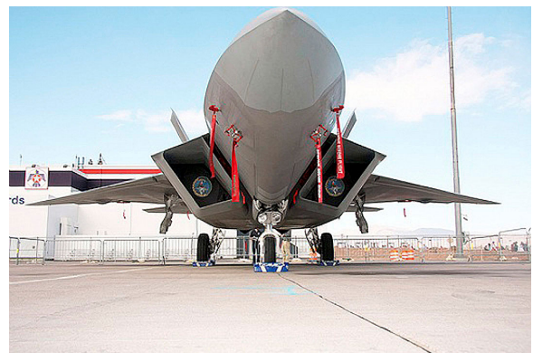
F-22 Raptor Engine Inlet Plugs Set