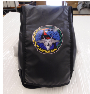
F-22 Raptor HUD Cover, padded