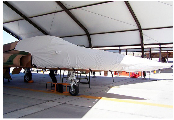
Northup F-5 Talon Canopy/Nose Cover