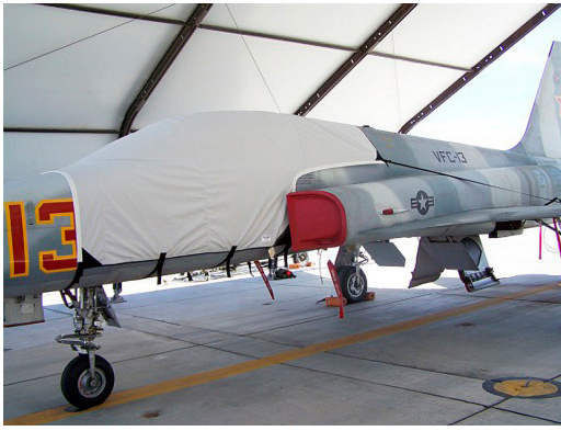
Northup F5 Talon Canopy Cover