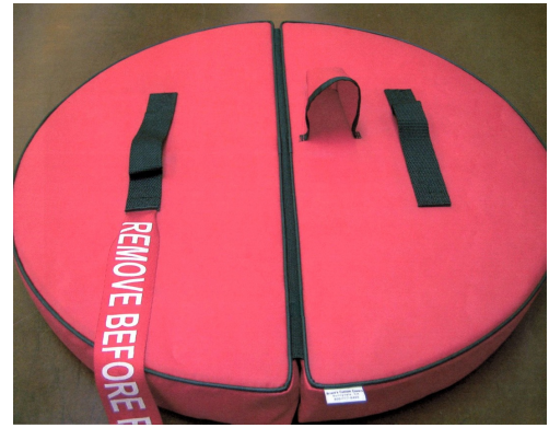
Falcon Center Engine Intake Plug