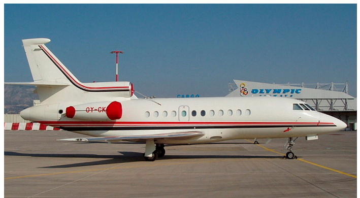
Falcon 900 Engine Covers