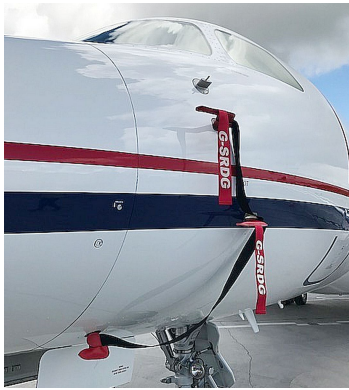
Falcon Jet 7X Pitot Probe/Aoa Set, Heat Resistant Type

The Engine Inlet Plugs are custom fit for your Falcon Jet 6X intakes, made with heavy-duty vinyl material, and stuffed with a single block of sculpted urethane foam. Each plug has a zipper that allows the foam to be removed and dried if necessary. Engine plugs have 'remove before flight' streamers sewn onto the face of the plugs. Most plugs are imprinted with the aircraft registration number in black for an extra charge. Storage bag NOT included. Engine plugs may be inserted after flight when the engine is still warm. Engine Inlet Plugs are commonly referred to as Cowl Plugs, Intake Plugs, Cowl Blocks, Engine Blocks, and Engine Bungs.