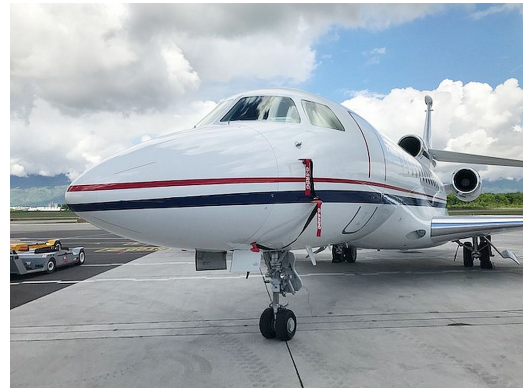
Falcon Jet 7X Pitot Probe/Aoa Set, Heat Resistant Type