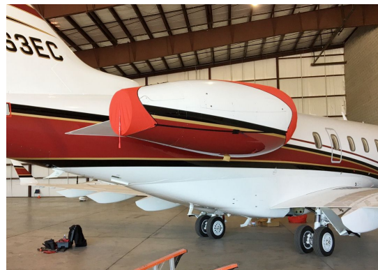
Canadair Challenger 300 Intake/Exhaust Covers, 3-Strap Type