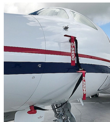
Falcon Jet 7X Pitot Probe/Aoa Set, Heat Resistant Type