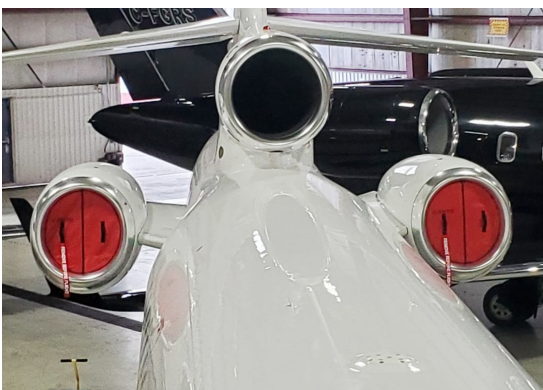
Falcon F7X Outboard Intake Plugs

The Engine Inlet Plugs are custom fit for your Falcon Jet 7X intakes, made with heavy-duty vinyl material, and stuffed with a single block of sculpted urethane foam. Each plug has a zipper that allows the foam to be removed and dried if necessary. Engine plugs have 'remove before flight' streamers sewn onto the face of the plugs. Most plugs are imprinted with the aircraft registration number in black for an extra charge. Storage bag NOT included. Engine plugs may be inserted after flight when the engine is still warm. Engine Inlet Plugs are commonly referred to as Cowl Plugs, Intake Plugs, Cowl Blocks, Engine Blocks, and Engine Bungs.