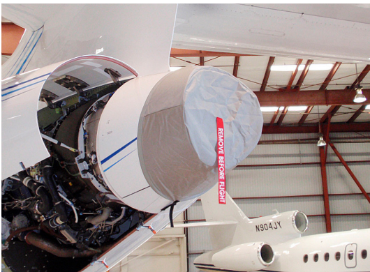
Falcon 7X Center Exhaust Cover

The Falcon Jet 7X Intake Covers are designed to install easily yet be completely storable. A spring steel hoop is sewn into the hem of each cover, allowing them to be installed without climbing onto the wing or using a stepladder. To store the covers the spring steel hoop folds like a band-saw blade into three nesting rings. Each cover folds into a compact circular bundle which is stored in the included duffle bag, yet they unfold quickly for use. The Tri-Fold Ring cover is made of medium weight nylon which is available in a variety of colors to match the paint trim. Each cover set comes complete with installation and folding instructions. The aircraft's registration number can be silkscreened onto the cover for an extra charge.