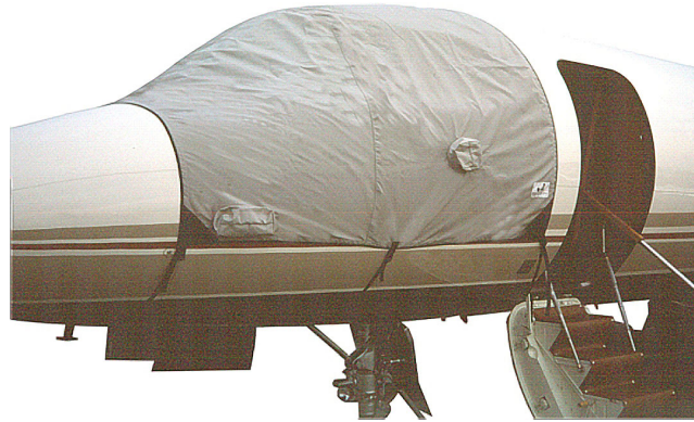
Falcon 50 Windshield Cover

This cover type is made from Silver Acrylic Sunbrella canvas and is 100% lined with a soft and smooth microfiber. Bruce's Custom Covers developed this material combination especially for aircraft protection. The outer material is medium weight and treated for water resistance, UV resistance and anti-static buildup. The inner lining is a very soft and smooth microfiber to prevent scratching. The material is very reflective, and tests show that the cabin interior temperature can be reduced to near-ambient temperature on the hottest of days. It is water, ice and snow repellent, yet breathable to allow moisture to escape from between the cover and the aircraft surface.