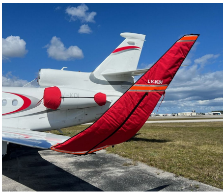
Falcon Jet 900 Winglet Padding Covers