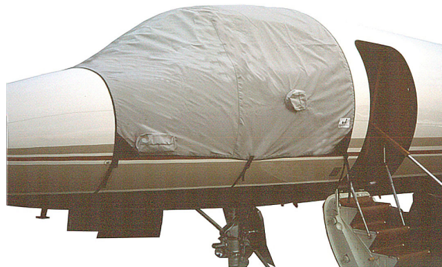
Falcon 50 Windshield Cover

This cover type is made from Silver Acrylic Sunbrella canvas and is 100% lined with a soft and smooth microfiber. Bruce's Custom Covers developed this material combination especially for aircraft protection. The outer material is medium weight and treated for water resistance, UV resistance and anti-static buildup. The inner lining is a very soft and smooth microfiber to prevent scratching. The material is very reflective, and tests show that the cabin interior temperature can be reduced to near-ambient temperature on the hottest of days. It is water, ice and snow repellent, yet breathable to allow moisture to escape from between the cover and the aircraft surface.