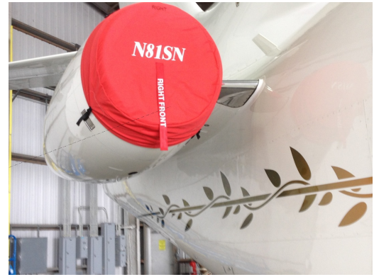
Falcon 900EX Intake Cover