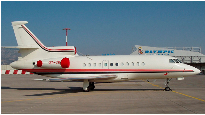
Falcon 900 Engine Covers