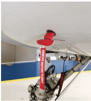
Grumman Gulfstream G-V Rosemont/TAT Cover