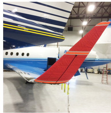
Falcon 2000 Winglet Pad