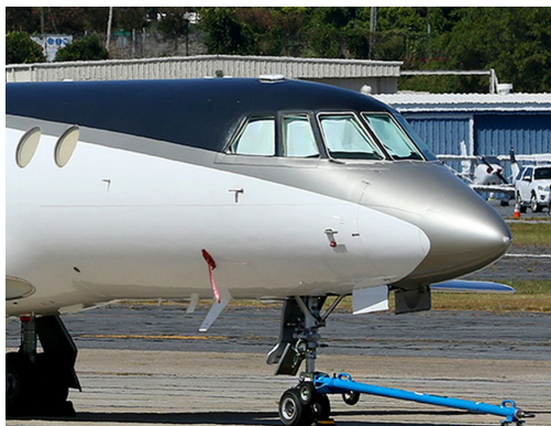
Dassault Falcon 50 Cockpit HeatShields

Cockpit Heatshields are interior sunshades for the aircraft's cockpit. The product is a unique composite of closed-cell foam with a silver mylar finish. The semi-rigid design is stiff enough to stand inside the window framing. The set folds up flat and is easily stored in the included storage sleeve. Some designs may require velcro and suction cups. Our Heatshields for jets are offered white side out because some aircraft manufacturers have issued advisories against reflective window inserts due to potential heat damage. A Heatshield is an excellent short-term remedy for cockpit overheating, but an external fabric cover is more effective for long-term protection.