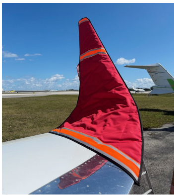
Falcon Jet 900 Winglet Padding Covers