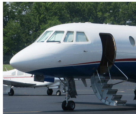
Dassault Falcon 50 Cockpit HeatShields