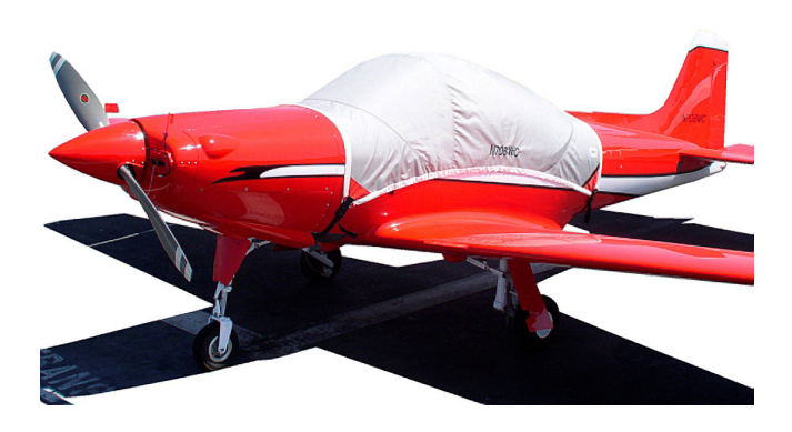
Falco Canopy Cover & Engine Plugs