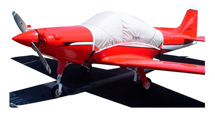
Falco Canopy Cover & Engine Plugs