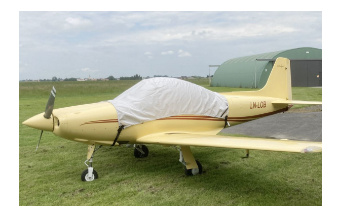
Sequoia Falco Canopy Cover

This cover type is made from Silver Acrylic Sunbrella canvas and is 100% lined with a soft and smooth microfiber. Bruce's Custom Covers developed this material combination especially for aircraft protection. The outer material is medium weight and treated for water resistance, UV resistance and anti-static buildup. The inner lining is a very soft and smooth microfiber to prevent scratching. The material is very reflective, and tests show that the cabin interior temperature can be reduced to near-ambient temperature on the hottest of days. It is water, ice and snow repellent, yet breathable to allow moisture to escape from between the cover and the aircraft surface.