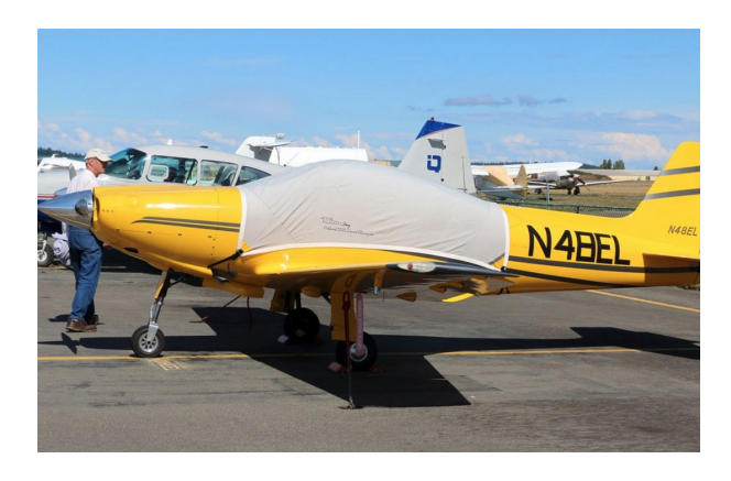
Sequoia Falco Travel Weight Canopy Cover

Travel Covers are made with Silver Solution-Dyed Polyester fabric and only lined over the windshield to save weight. The material is lightweight and more compact for easy stowage in the aircraft. The polyester material is water resistant, but only intended for occasional use outside. We also have an ultra lightweight material available for fitted hangar dust covers. For daily outdoor use, the non-travel Sunbrella Cover is the best choice.