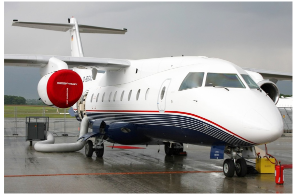
Fairchild/Dornier 328 Engine Covers