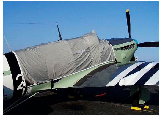
Fairey Firefly Canopy Cover