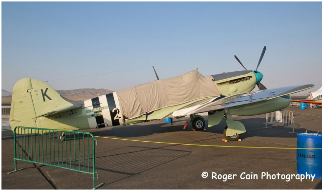
Fairey Firefly Canopy Cover