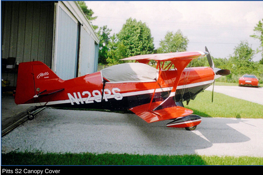
Pitts S2 Canopy Cover