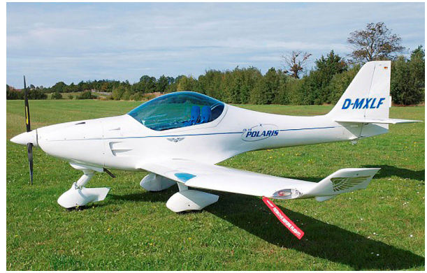
Covers & Plugs for the FK-14 Polaris