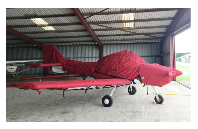
FLS Club Sprint Extended Canopy Cover

Covers developed this material combination especially for aircraft protection. The outer material is medium weight and treated for water resistance, UV resistance and anti-static buildup. The inner lining is a very soft and smooth microfiber to prevent scratching. The material is very reflective, and tests show that the cabin interior temperature can be reduced to near-ambient temperature on the hottest of days. It is water, ice and snow repellent, yet breathable to allow moisture to escape from between the cover and the aircraft surface.