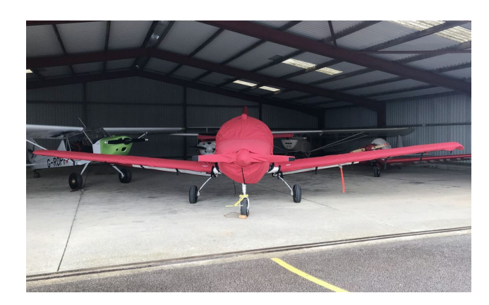
FLS Club Sprint Empennage Cover (Tailboom, Vertical & Horiz Stabilizers) All Year Use