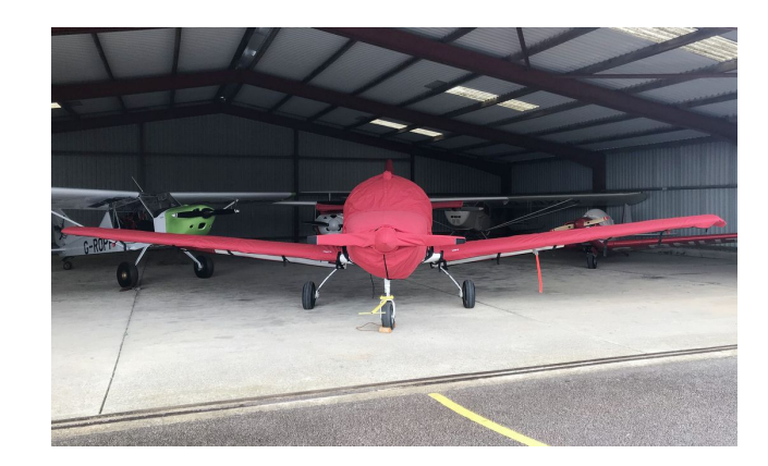
FLS Club Sprint Empennage Cover (Tailboom, Vertical & Horiz Stabilizers) All Year Use