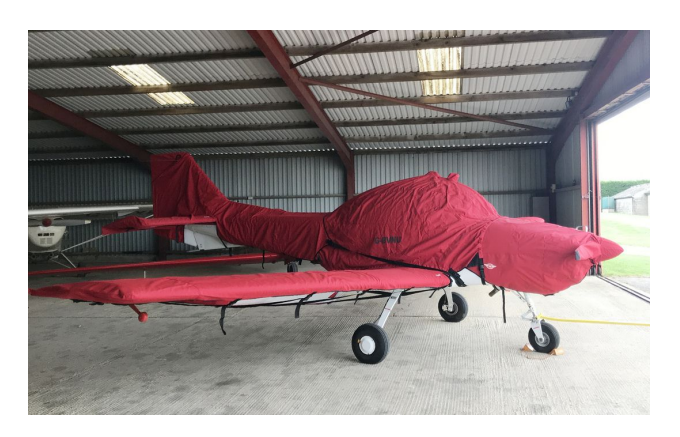
FLS Club Sprint Extended Canopy Cover

WINTER USE MATERIAL - Made with Solution-Dyed Polyester fabric, this option is intended for seasonal use to aid in deicing, rain mitigation, or for occasional travel. The material is lighter and more compact, but more susceptible to UV damage and may have a shorter useful life if used continuously outside than the all-year use material.