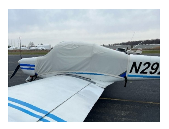
SC Aerostar Festival Canopy Cover