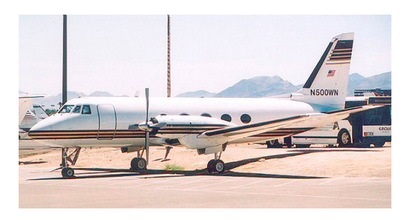
Covers, Plugs, HeatShields and related items for the Grumman Gulfstream I