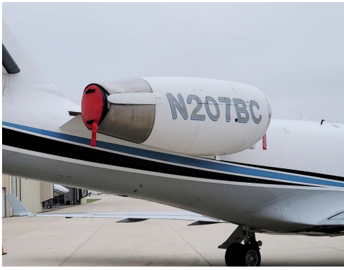
Gulfstream G100 Exhaust Plugs