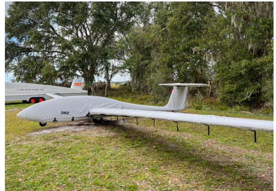
Burkhart Grob G 103 TWIN II Complete Cover Set