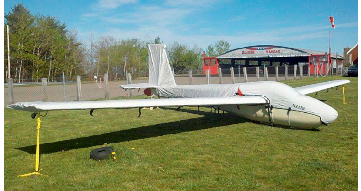
Schweizer 1-26B Canopy/Nose, Empennage & Wing Covers