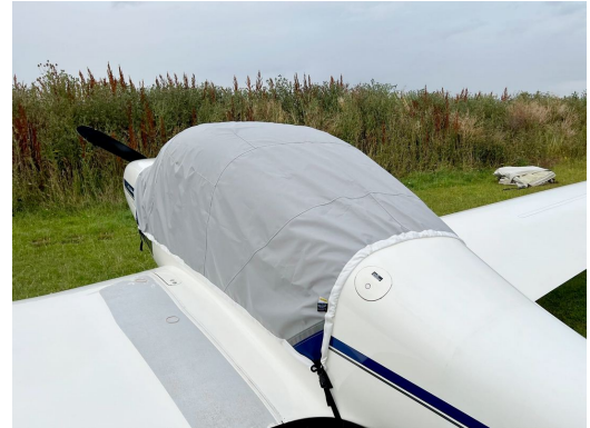
Grob 109 Travel Cover, Light Weight Canopy Cover