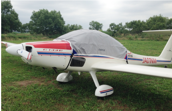
Grob 109 Travel Cover, Light Weight Travel Canopy Cover