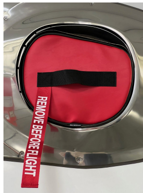
Gulfstream V APU Exhaust Plug

The Engine Inlet Plugs are custom fit for your Gulfstream Aerospace Gulfstream G150 intakes, made with heavy-duty vinyl material, and stuffed with a single block of sculpted urethane foam. Each plug has a zipper that allows the foam to be removed and dried if necessary. Engine plugs have 'remove before flight' streamers sewn onto the face of the plugs. Most plugs are imprinted with the aircraft registration number in black for an extra charge. Storage bag NOT included. Engine plugs may be inserted after flight when the engine is still warm. Engine Inlet Plugs are commonly referred to as Cowl Plugs, Intake Plugs, Cowl Blocks, Engine Blocks, and Engine Bungs.