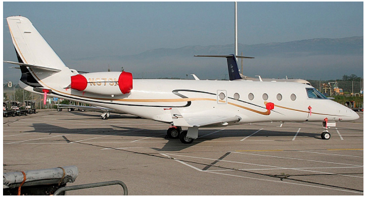
Engine Cover Set