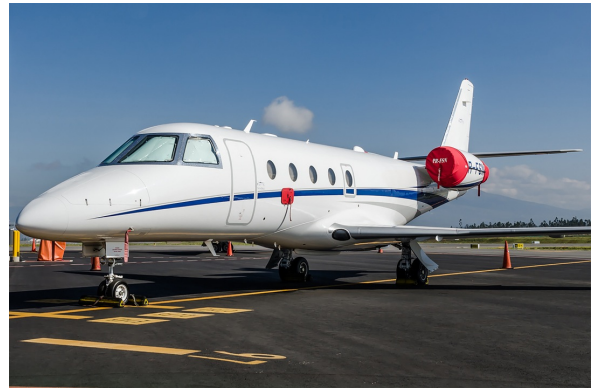
Gulfstream G150 Engine Covers, Cockpit HeatShields