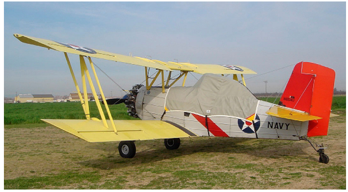
Canopy Cover for the Grumman Ag Cat