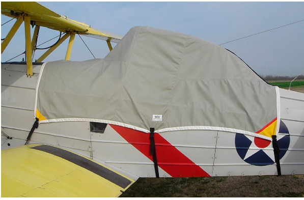
Grumman Ag-Cat Canopy Cover