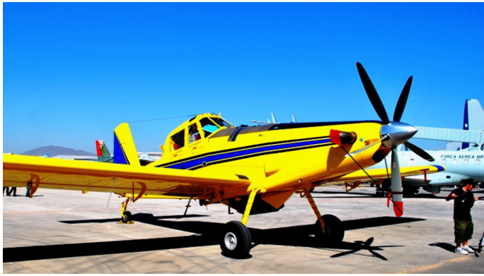
Air Tractor Prop Tie/Exhaust Covers