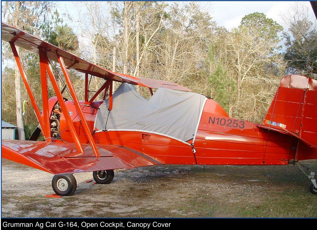
Grumman Ag Cat G-164, Open Cockpit, Canopy Cover