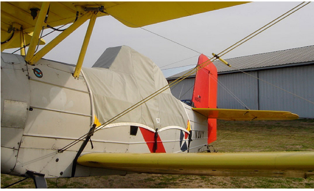
Ag-Cat Canopy Cover