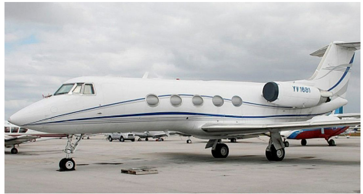
Grumman Gulfstream G-IV SP Engine Cover, bikini type Gulfstream G2 Intake Covers (Come in colors) & Cockpit HeatShield Set