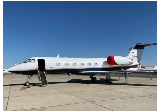
Grumman Gulfstream G-IV SP Engine Cover, bikini type