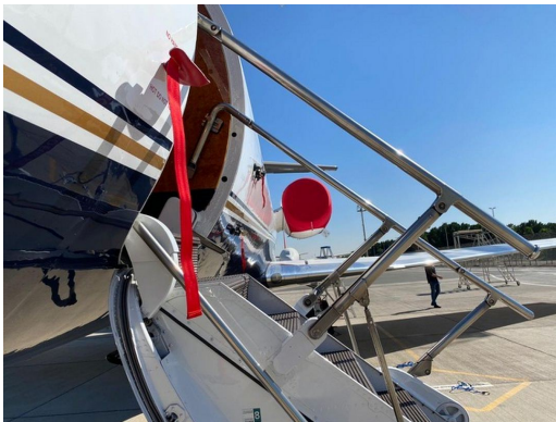
Grumman Gulfstream G-IV SP Pitot Cover

The Engine Inlet Plugs are custom fit for your Gulfstream Aerospace Gulfstream II, III (C-20D) intakes, made with heavy-duty vinyl material, and stuffed with a single block of sculpted urethane foam. Each plug has a zipper that allows the foam to be removed and dried if necessary. Engine plugs have 'remove before flight' streamers sewn onto the face of the plugs. Most plugs are imprinted with the aircraft registration number in black for an extra charge. Storage bag NOT included. Engine plugs may be inserted after flight when the engine is still warm. Engine Inlet Plugs are commonly referred to as Cowl Plugs, Intake Plugs, Cowl Blocks, Engine Blocks, and Engine Bungs.