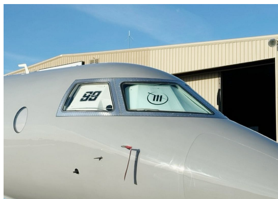
Gulfstream G200 Cockpit Heatshields

Cockpit Heatshields are interior sunshades for the aircraft's cockpit. The product is a unique composite of closed-cell foam with a silver mylar finish. The semi-rigid design is stiff enough to stand inside the window framing. The set folds up flat and is easily stored in the included storage sleeve. Some designs may require velcro and suction cups. Our Heatshields for jets are offered white side out because some aircraft manufacturers have issued advisories against reflective window inserts due to potential heat damage. A Heatshield is an excellent short-term remedy for cockpit overheating, but an external fabric cover is more effective for long-term protection.