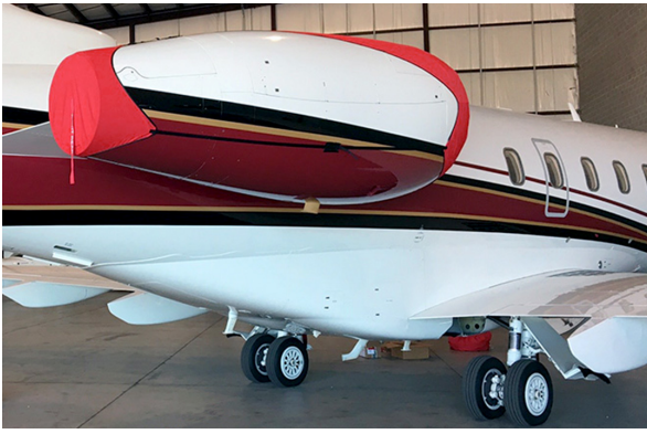
Intake/Exhaust Covers, 3-Strap Type. Successfully installed by two crew, one ladder.