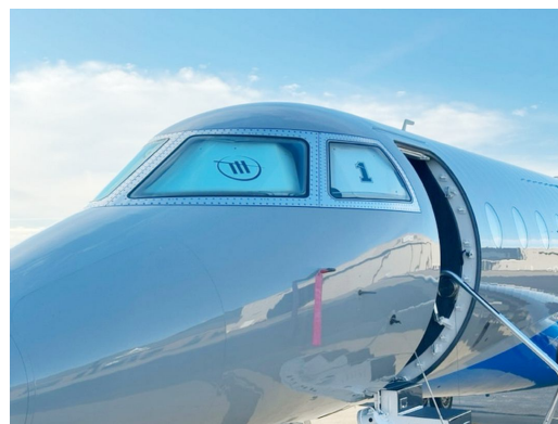
Gulfstream G200 Cockpit Heatshields