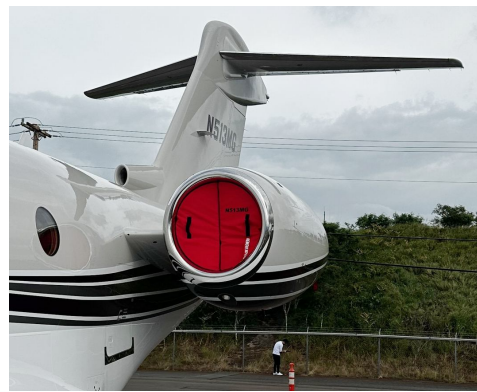
Gulfstream G280 Intake Plugs