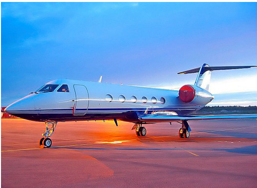
Gulfstream G-IV Intake Covers

The Gulfstream Aerospace Gulfstream IV (C-20G), G350, G450 Intake Covers are designed to install easily yet be completely storable. A spring steel hoop is sewn into the hem of each cover, allowing them to be installed without climbing onto the wing or using a stepladder. To store the covers the spring steel hoop folds like a band-saw blade into three nesting rings. Each cover folds into a compact circular bundle which is stored in the included duffle bag, yet they unfold quickly for use. The Tri-Fold Ring cover is made of medium weight nylon which is available in a variety of colors to match the paint trim. Each cover set comes complete with installation and folding instructions. The aircraft's registration number can be silkscreened onto the cover for an extra charge.