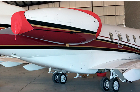
Intake/Exhaust Covers, 3-Strap Type. Successfully installed by two crew, one ladder.

The Gulfstream Aerospace Gulfstream IV (C-20G), G350, G450 Intake Covers are designed to install easily yet be completely storable. A spring steel hoop is sewn into the hem of each cover, allowing them to be installed without climbing onto the wing or using a stepladder. To store the covers the spring steel hoop folds like a band-saw blade into three nesting rings. Each cover folds into a compact circular bundle which is stored in the included duffle bag, yet they unfold quickly for use. The Tri-Fold Ring cover is made of medium weight nylon which is available in a variety of colors to match the paint trim. Each cover set comes complete with installation and folding instructions. The aircraft's registration number can be silkscreened onto the cover for an extra charge.