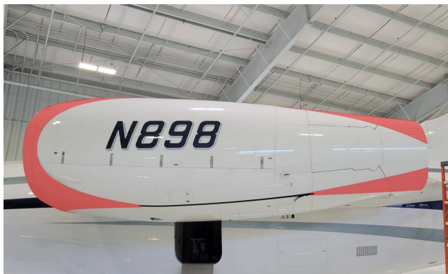
Gulfstream Aerospace G-IV (G350), Intake/Exhaust Cover, test fit cover

The Gulfstream Aerospace Gulfstream IV (C-20G), G350, G450 Intake Covers are designed to install easily yet be completely storable. A spring steel hoop is sewn into the hem of each cover, allowing them to be installed without climbing onto the wing or using a stepladder. To store the covers the spring steel hoop folds like a band-saw blade into three nesting rings. Each cover folds into a compact circular bundle which is stored in the included duffle bag, yet they unfold quickly for use. The Tri-Fold Ring cover is made of medium weight nylon which is available in a variety of colors to match the paint trim. Each cover set comes complete with installation and folding instructions. The aircraft's registration number can be silkscreened onto the cover for an extra charge.