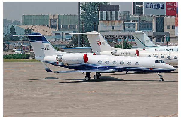
Gulfstream G-IV Intake Covers