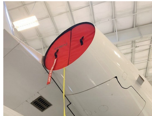
Grumman Gulfstream G-V Exhaust Plugs