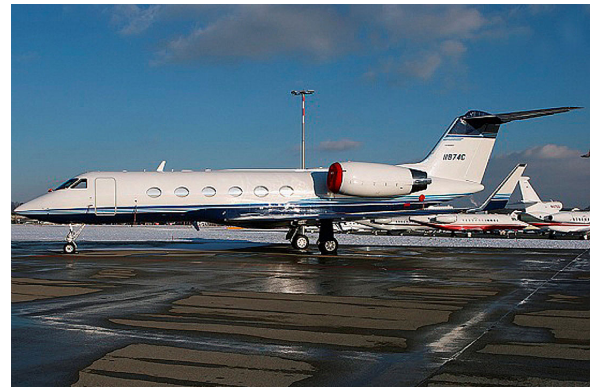
Gulfstream G-IV Intake Covers