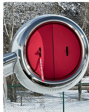
Gulfstream Aerospace Gulfstream GVII (G400,