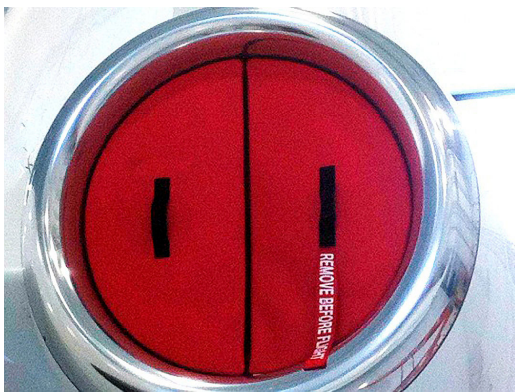
Falcon 2000EX Intake Plug

The Engine Inlet Plugs are custom fit for your Gulfstream Aerospace Gulfstream GVII (G400, G500, G600, G700, G800) intakes, made with heavy-duty vinyl material, and stuffed with a single block of sculpted urethane foam. Each plug has a zipper that allows the foam to be removed and dried if necessary. Engine plugs have 'remove before flight' streamers sewn onto the face of the plugs. Most plugs are imprinted with the aircraft registration number in black for an extra charge. Storage bag NOT included. Engine plugs may be inserted after flight when the engine is still warm. Engine Inlet Plugs are commonly referred to as Cowl Plugs, Intake Plugs, Cowl Blocks, Engine Blocks, and Engine Bungs.