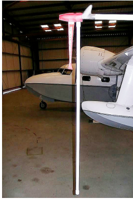
Grumman Mallard Pitot Cover with Install Tool

Canopy Covers are commonly referred to as Cabin Covers, Fuselage Covers, Canvas Covers, Canopy Caps, etc.