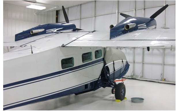
Grumman G44 Widgeon Cockpit/Nose Cover