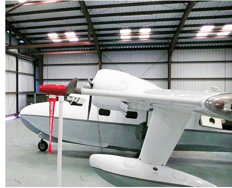
Grumman Mallard Pitot Cover with Install Tool