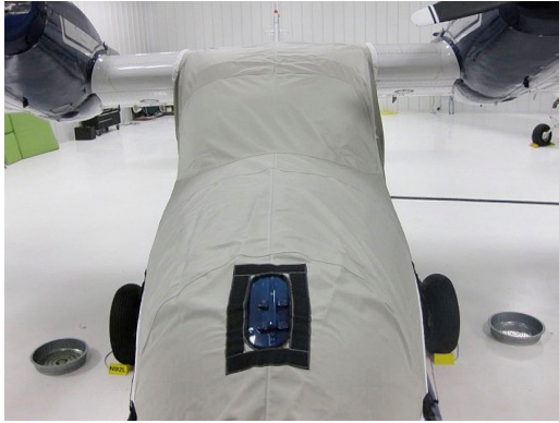
Grumman Widgeon Cockpit/Nose Cover, tie-down cleat detail

Canopy Covers are commonly referred to as Cabin Covers, Fuselage Covers, Canvas Covers, Canopy Caps, etc.