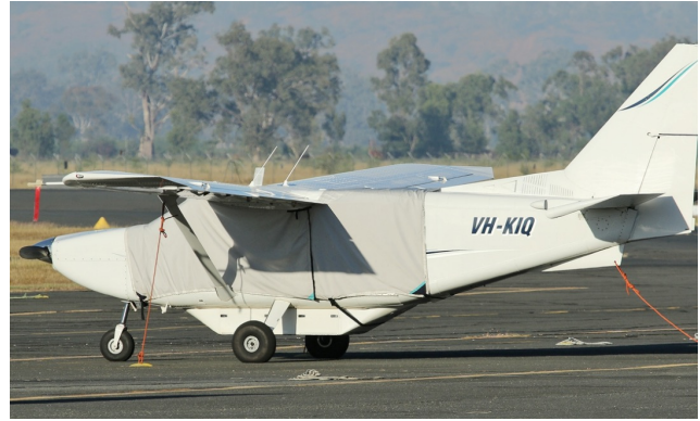
Gippsland GA-8 Airvan Extended Canopy Cover