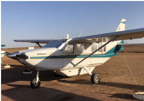
Gippsland GA-8 Airvan

Cockpit Heatshields are interior sunshades for the aircraft's cockpit. The product is a unique composite of closed-cell foam with a silver mylar finish. The semi-rigid design is stiff enough to stand inside the window framing. The set folds up flat and is easily stored in the included storage sleeve. Some designs may require velcro and suction cups. A Heatshield is an excellent short-term remedy for cockpit overheating, but an external fabric cover is more effective for long-term protection.