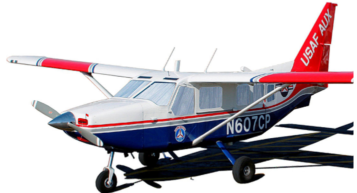
Covers, Plugs & HeatShields for the Gippsland GA-8 Airvan