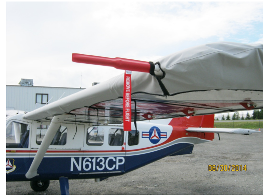
Gippsland GA-8 Airvan Wing Covers, Pitot Cover