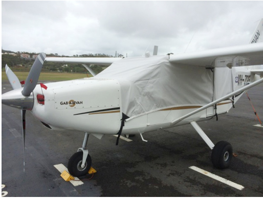
Gippsland GA-8 Airvan Canopy Cover

This cover type is made from Silver Acrylic Sunbrella canvas and is 100% lined with a soft and smooth microfiber. Bruce's Custom Covers developed this material combination especially for aircraft protection. The outer material is medium weight and treated for water resistance, UV resistance and anti-static buildup. The inner lining is a very soft and smooth microfiber to prevent scratching. The material is very reflective, and tests show that the cabin interior temperature can be reduced to near-ambient temperature on the hottest of days. It is water, ice and snow repellent, yet breathable to allow moisture to escape from between the cover and the aircraft surface.