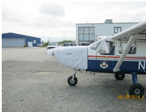
Gippsland GA-8 Airvan Insulated Engine and Prop Covers