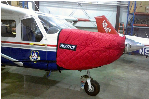
GA-8 Insulated Engine Cover

This cover type is made from Silver Acrylic Sunbrella canvas and is 100% lined with a soft and smooth microfiber. Bruce's Custom Covers developed this material combination especially for aircraft protection. The outer material is medium weight and treated for water resistance, UV resistance and anti-static buildup. The inner lining is a very soft and smooth microfiber to prevent scratching. The material is very reflective, and tests show that the cabin interior temperature can be reduced to near-ambient temperature on the hottest of days. It is water, ice and snow repellent, yet breathable to allow moisture to escape from between the cover and the aircraft surface.