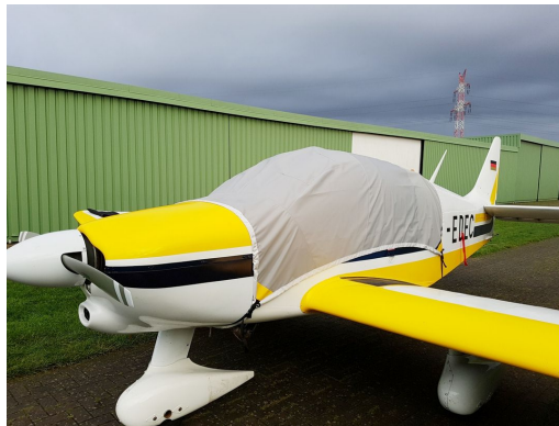
Robin DR400/R Travel Cover, Light Weight Travel Canopy Cover

This cover type is made from Silver Acrylic Sunbrella canvas and is 100% lined with a soft and smooth microfiber. Bruce's Custom Covers developed this material combination especially for aircraft protection. The outer material is medium weight and treated for water resistance, UV resistance and anti-static buildup. The inner lining is a very soft and smooth microfiber to prevent scratching. The material is very reflective, and tests show that the cabin interior temperature can be reduced to near-ambient temperature on the hottest of days. It is water, ice and snow repellent, yet breathable to allow moisture to escape from between the cover and the aircraft surface.