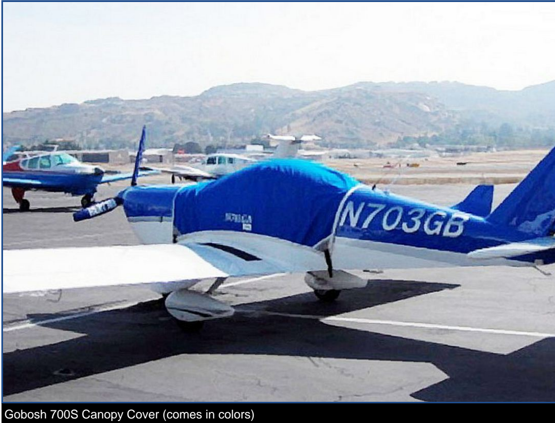
Gobosh 700S Canopy Cover (comes in colors)