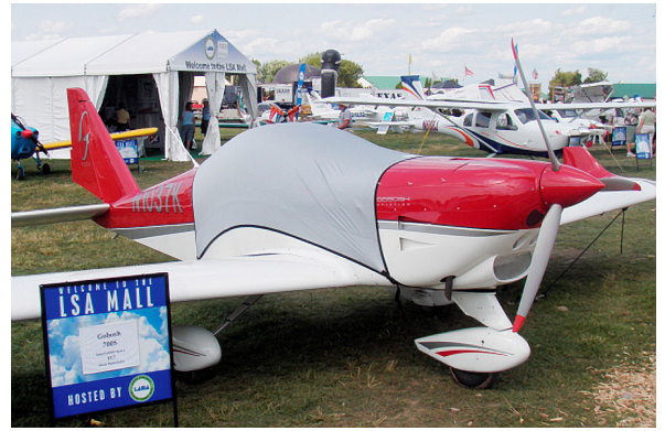
Gobosh GB7 Light Weight Travel-Cover