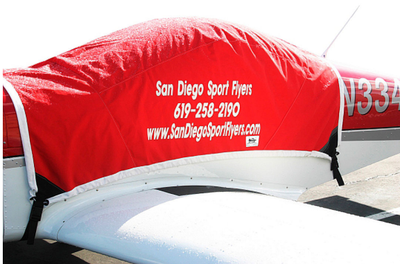
Gobosh Canopy Cover with custom Imprint

This cover type is made from Silver Acrylic Sunbrella canvas and is 100% lined with a soft and smooth microfiber. Bruce's Custom Covers developed this material combination especially for aircraft protection. The outer material is medium weight and treated for water resistance, UV resistance and anti-static buildup. The inner lining is a very soft and smooth microfiber to prevent scratching. The material is very reflective, and tests show that the cabin interior temperature can be reduced to near-ambient temperature on the hottest of days. It is water, ice and snow repellent, yet breathable to allow moisture to escape from between the cover and the aircraft surface.