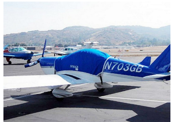
Gobosh 700S Canopy Cover (comes in colors)