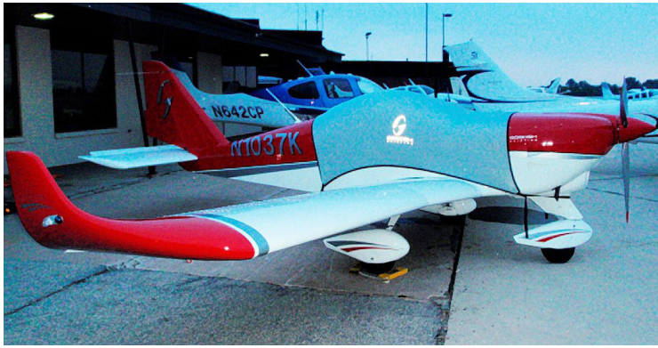
Gobosh Light Weight Travel-Cover