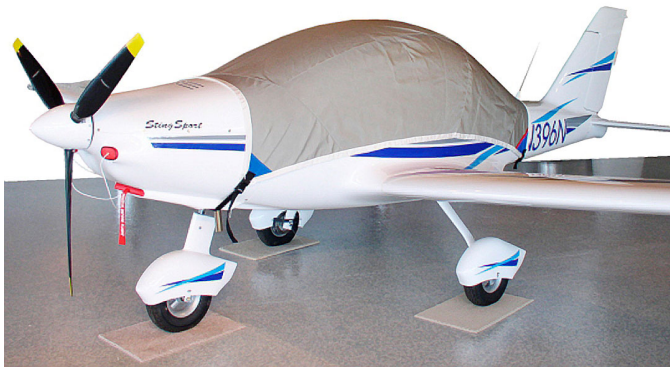
Sting Sport Canopy Cover & Engine Plugs

This cover type is made from Silver Acrylic Sunbrella canvas and is 100% lined with a soft and smooth microfiber. Bruce's Custom Covers developed this material combination especially for aircraft protection. The outer material is medium weight and treated for water resistance, UV resistance and anti-static buildup. The inner lining is a very soft and smooth microfiber to prevent scratching. The material is very reflective, and tests show that the cabin interior temperature can be reduced to near-ambient temperature on the hottest of days. It is water, ice and snow repellent, yet breathable to allow moisture to escape from between the cover and the aircraft surface.