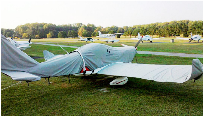
Gobosh Full Cover Set

WINTER USE MATERIAL - Made with Solution-Dyed Polyester fabric, this option is intended for seasonal use to aid in deicing, rain mitigation, or for occasional travel. The material is lighter and more compact, but more susceptible to UV damage and may have a shorter useful life if used continuously outside than the all-year use material.