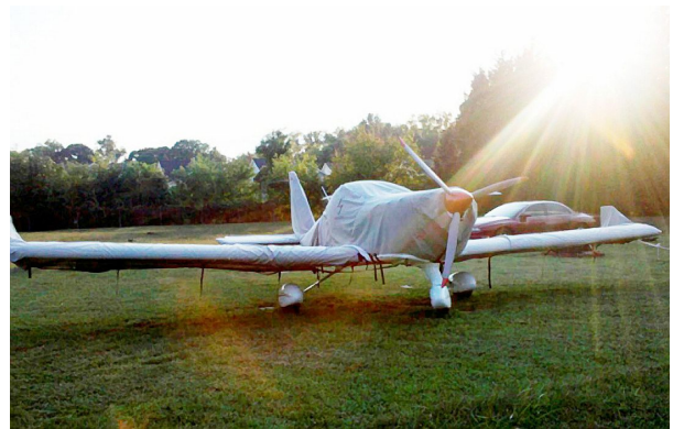
Gobosh Full Cover Set