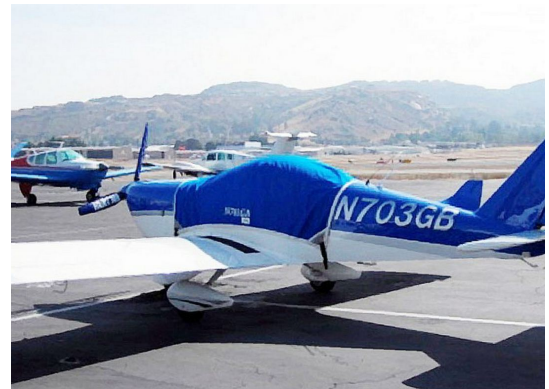
Gobosh 700S Canopy Cover (comes in colors)