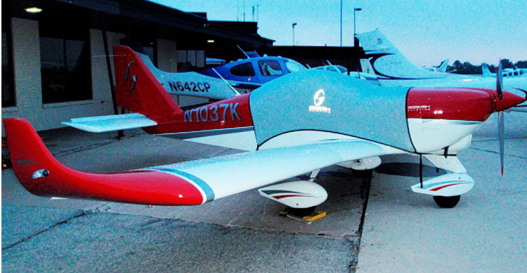
Gobosh Light Weight Travel-Cover

Travel Covers are made with Silver Solution-Dyed Polyester fabric and only lined over the windshield to save weight. The material is lightweight and more compact for easy stowage in the aircraft. The polyester material is water resistant, but only intended for occasional use outside. We also have an ultra lightweight material available for fitted hangar dust covers. For daily outdoor use, the non-travel Sunbrella Cover is the best choice.