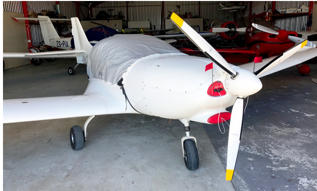
Gobosh 800XP Travel Cover, Light Weight Travel Canopy Cover and Inlet Plugs

Engine Inlet Plugs are custom fit for your Gobosh 800XP intakes, made with heavy-duty vinyl material, and stuffed with a single block of sculpted urethane foam. Each plug has a zipper that allows the foam to be removed and dried if necessary. Engine plugs have warning flags that are visible from the cockpit or 'remove before flight' streamers sewn onto the face of the plugs. Most plugs are imprinted with the aircraft registration number in black for an extra charge. Storage bag NOT included. Engine plugs may be inserted after flight when the engine is still warm. Engine Inlet Plugs are commonly referred to as Cowl Plugs, Intake Plugs, Cowl Blocks, Engine Blocks, and Engine Bungs.