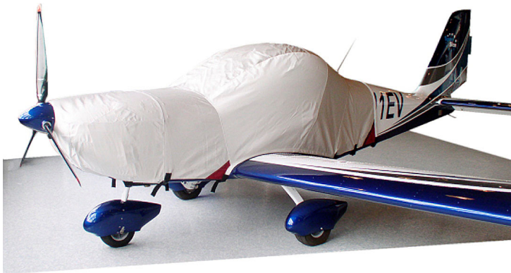
Ekvator Sportstar Extended Canopy/Engine Cover

This cover type is made from Silver Acrylic Sunbrella canvas and is 100% lined with a soft and smooth microfiber. Bruce's Custom Covers developed this material combination especially for aircraft protection. The outer material is medium weight and treated for water resistance, UV resistance and anti-static buildup. The inner lining is a very soft and smooth microfiber to prevent scratching. The material is very reflective, and tests show that the cabin interior temperature can be reduced to near-ambient temperature on the hottest of days. It is water, ice and snow repellent, yet breathable to allow moisture to escape from between the cover and the aircraft surface.