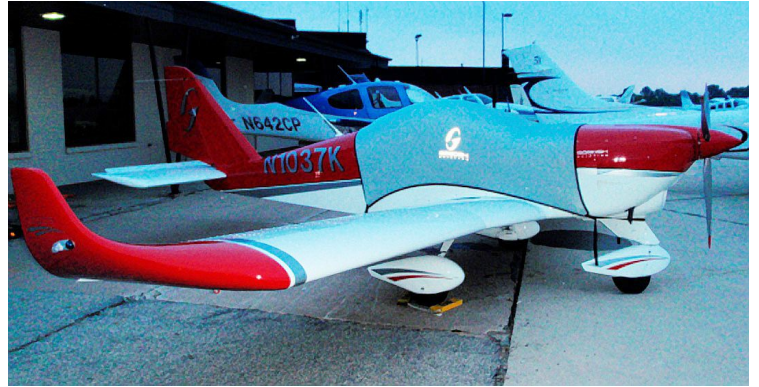
Gobosh Light Weight Travel-Cover