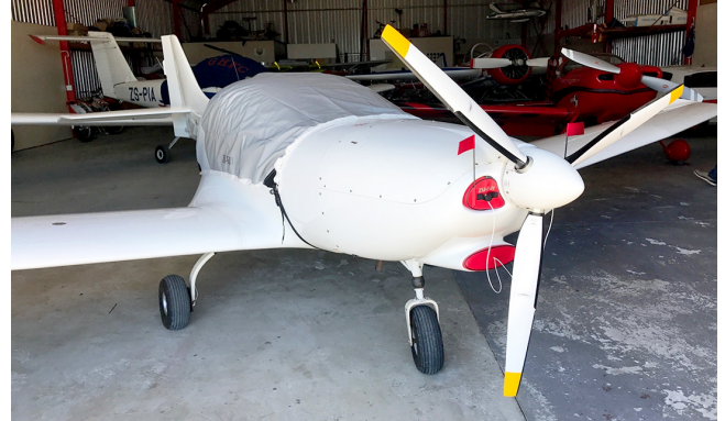
Gobosh 800XP Travel Cover, Light Weight Travel Canopy Cover and Inlet Plugs