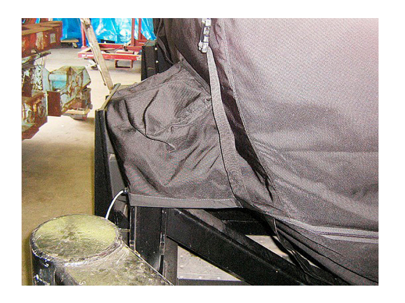
GE90-115 Propulsor QEC Engine Long-term Storage/Transport Cover "Bag" Boeing 777