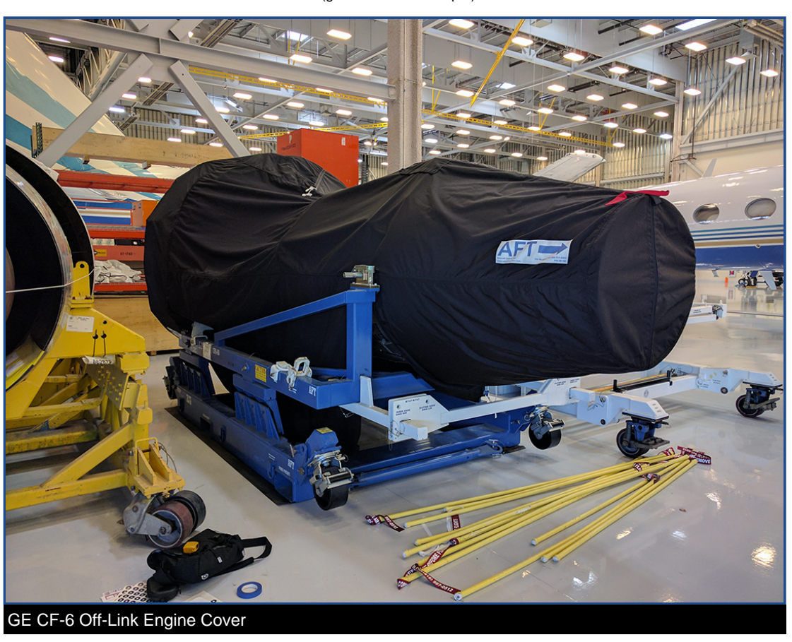
Section 2: Engine Covers

Off-Link Engine Covers protect commercial aircraft engines while in storage. They protect the engine from the elements, prevent surface contamination from oil leaks, and help stop "parts robbing". There are three types: Complete, partial and component covers.