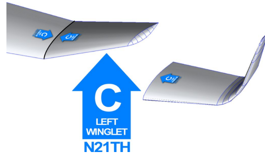
Blanik L23 Wing & Horizontal Stabilizer Covers