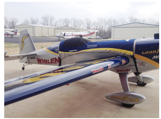
Extra 300SC with NASCAR style custom cover