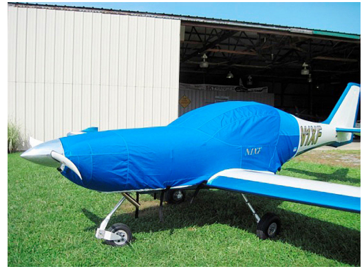
Arion Lightning Extended Canopy/Engine Cover