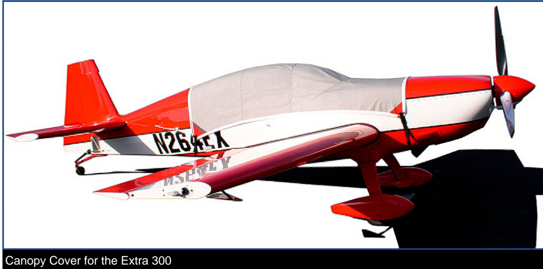
Canopy Cover for the Extra 300