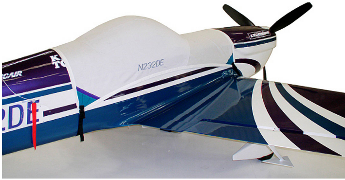
Cap 232 Canopy Cover