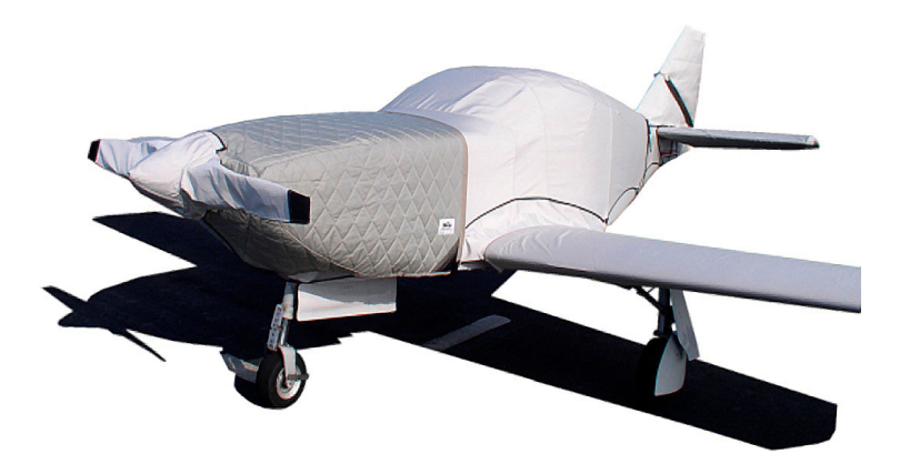
Glasair I Insulated Engine Cover, Prop Cover, Etc.

WINTER USE MATERIAL - Made with Solution-Dyed Polyester fabric, this option is intended for seasonal use to aid in deicing, rain mitigation, or for occasional travel. The material is lighter and more compact, but more susceptible to UV damage and may have a shorter useful life if used continuously outside than the all-year use material.