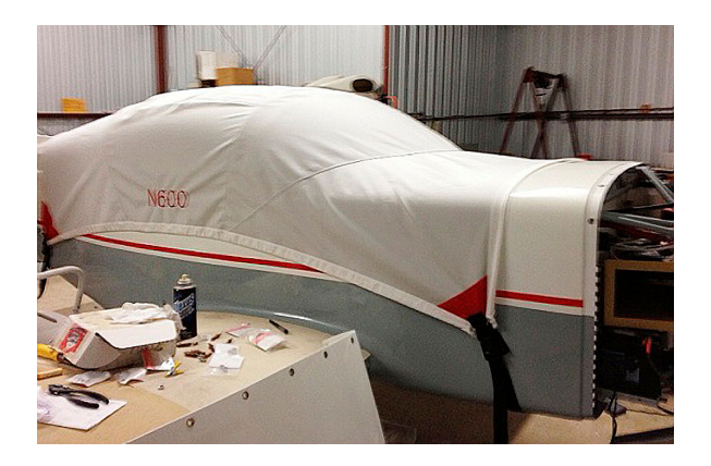
Glasair II/III Canopy Cover

This cover type is made from Silver Acrylic Sunbrella canvas and is 100% lined with a soft and smooth microfiber. Bruce's Custom Covers developed this material combination especially for aircraft protection. The outer material is medium weight and treated for water resistance, UV resistance and anti-static buildup. The inner lining is a very soft and smooth microfiber to prevent scratching. The material is very reflective, and tests show that the cabin interior temperature can be reduced to near-ambient temperature on the hottest of days. It is water, ice and snow repellent, yet breathable to allow moisture to escape from between the cover and the aircraft surface.