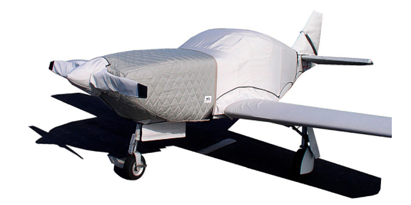
Glasair Aviation Glasair II & III Propellor/Spinner Cover, 2 Blade