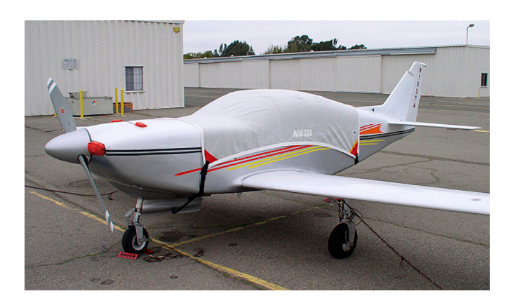
Glasair II/III Canopy Cover & Plugs