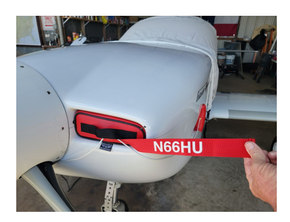
GLASAIR S2-RG Canopy Cover, Engine Plugs

Engine Inlet Plugs are custom fit for your Glasair Aviation Glasair II & III intakes, made with heavy-duty vinyl material, and stuffed with a single block of sculpted urethane foam. Each plug has a zipper that allows the foam to be removed and dried if necessary. Engine plugs have warning flags that are visible from the cockpit or 'remove before flight' streamers sewn onto the face of the plugs. Most plugs are imprinted with the aircraft registration number in black for an extra charge. Storage bag NOT included. Engine plugs may be inserted after flight when the engine is still warm. Engine Inlet Plugs are commonly referred to as Cowl Plugs, Intake Plugs, Cowl Blocks, Engine Blocks, and Engine Bungs.