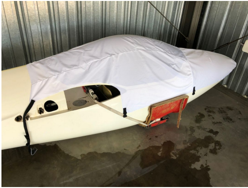
Glasflugel H-301B Libelle Canopy/Nose Cover, test fit cover

water resistance, UV resistance and anti-static buildup. The inner lining is a very soft and smooth microfiber to prevent scratching. The material is very reflective, and tests show that the cabin interior temperature can be reduced to near-ambient temperature on the hottest of days. It is water, ice and snow repellent, yet breathable to allow moisture to escape from between the cover and the aircraft surface.