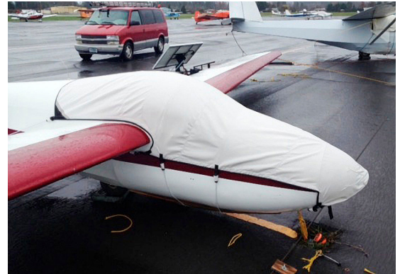
SGS 1-26B Canopy/Nose Cover