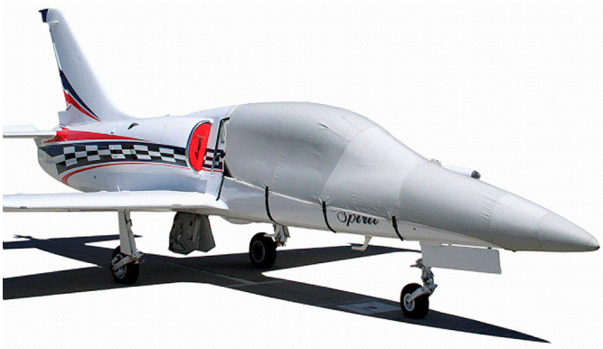
L39 Canopy/Nose Cover & Intake Plugs

Covers developed this material combination especially for aircraft protection. The outer material is medium weight and treated for water resistance, UV resistance and anti-static buildup. The inner lining is a very soft and smooth microfiber to prevent scratching. The material is very reflective, and tests show that the cabin interior temperature can be reduced to near-ambient temperature on the hottest of days. It is water, ice and snow repellent, yet breathable to allow moisture to escape from between the cover and the aircraft surface.