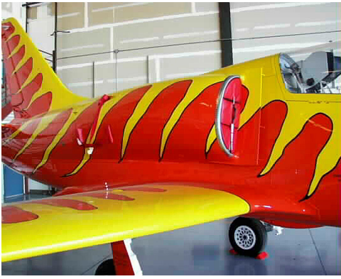
Inlet Plug, folding type