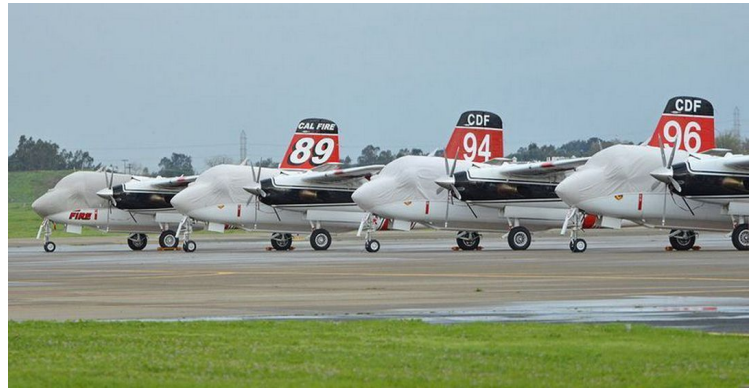
Grumman S2 Tracker Canopy/Nose Covers