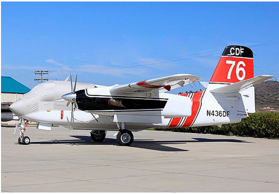
Grumman Tracker (turbine model) Canopy/Nose Cover