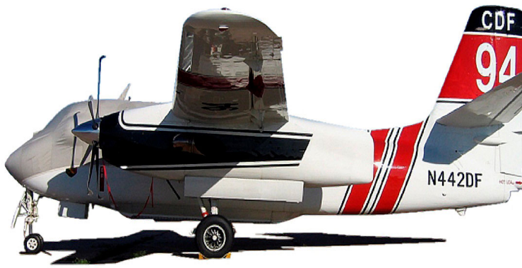
Grumman Tracker (turbine model) Canopy/Nose Cover