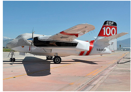
Grumman Tracker (turbine model) Canopy/Nose Cover