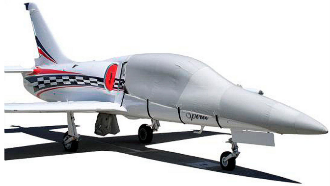
L39 Canopy/Nose Cover & Intake Plugs