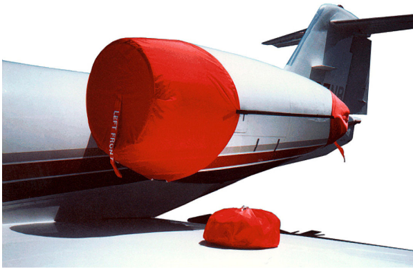
Lear 35 Engine Covers