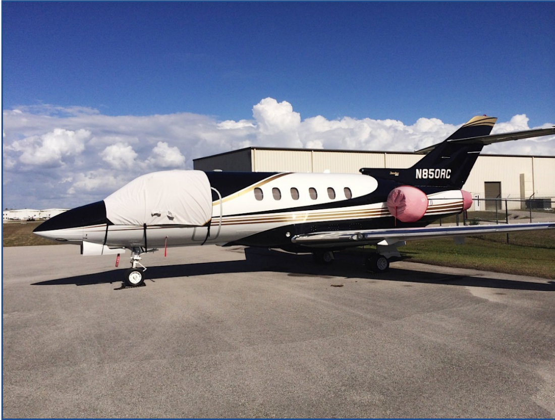
Hawker 800 Cockpit Cover, extended aft 24"