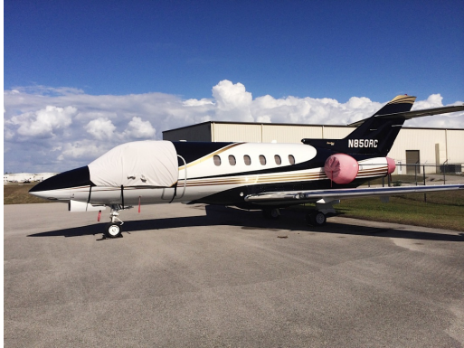
Hawker 800 Cockpit Cover, extended aft 24"

This cover type is made from Silver Acrylic Sunbrella canvas and is 100% lined with a soft and smooth microfiber. Bruce's Custom Covers developed this material combination especially for aircraft protection. The outer material is medium weight and treated for water resistance, UV resistance and anti-static buildup. The inner lining is a very soft and smooth microfiber to prevent scratching. The material is very reflective, and tests show that the cabin interior temperature can be reduced to near-ambient temperature on the hottest of days. It is water, ice and snow repellent, yet breathable to allow moisture to escape from between the cover and the aircraft surface.