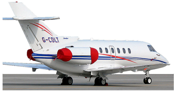
Hawker 800 Tri-Fold Engine Covers