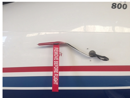
Hawker Beechcraft 800, 800XP, 850XP Pitot Covers With Aoa Straps

The Engine Inlet Plugs are custom fit for your British Aerospace Hawker 700 intakes, made with heavy-duty vinyl material, and stuffed with a single block of sculpted urethane foam. Each plug has a zipper that allows the foam to be removed and dried if necessary. Engine plugs have 'remove before flight' streamers sewn onto the face of the plugs. Most plugs are imprinted with the aircraft registration number in black for an extra charge. Storage bag NOT included. Engine plugs may be inserted after flight when the engine is still warm. Engine Inlet Plugs are commonly referred to as Cowl Plugs, Intake Plugs, Cowl Blocks, Engine Blocks, and Engine Bungs.