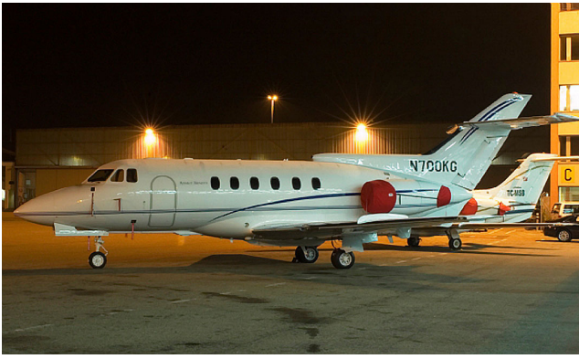
Hawker 700 Engine Cover sets w/ & w/o TR's