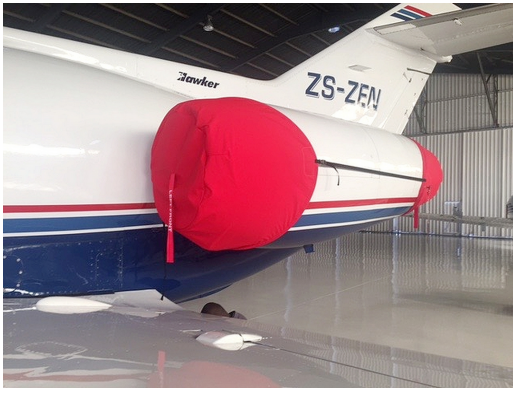
Hawker Beechcraft 800, 800XP, 850XP Engine Covers (With Tr's)