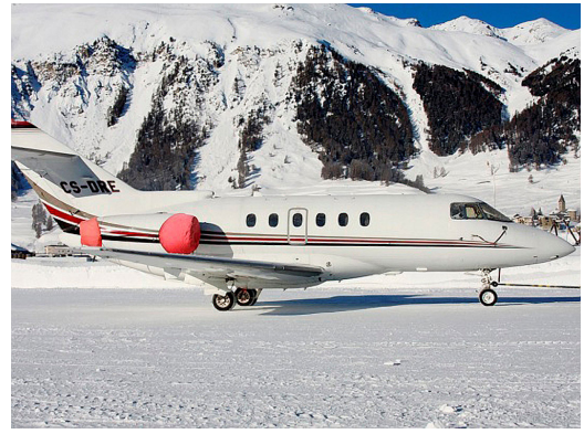
Hawker 800 Tri-Fold Engine Covers & Pitot Covers