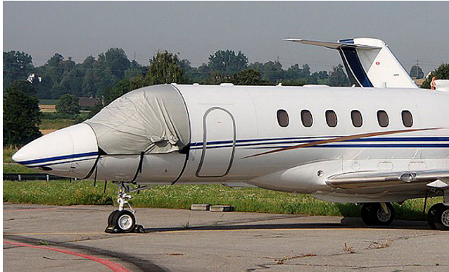
Hawker 800 Cockpit Cover

This cover type is made from Silver Acrylic Sunbrella canvas and is 100% lined with a soft and smooth microfiber. Bruce's Custom Covers developed this material combination especially for aircraft protection. The outer material is medium weight and treated for water resistance, UV resistance and anti-static buildup. The inner lining is a very soft and smooth microfiber to prevent scratching. The material is very reflective, and tests show that the cabin interior temperature can be reduced to near-ambient temperature on the hottest of days. It is water, ice and snow repellent, yet breathable to allow moisture to escape from between the cover and the aircraft surface.