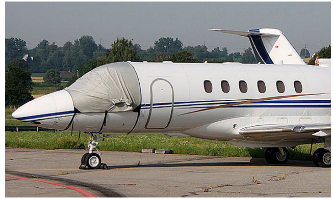
Hawker 800 Cockpit Cover