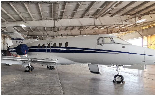
Hawker 750 HeatShields & Engine Covers