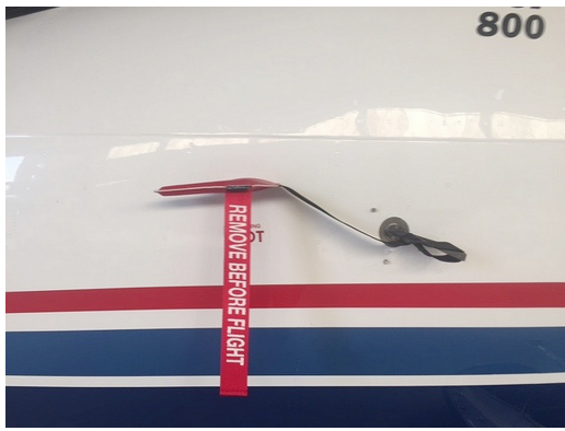
Hawker Beechcraft 800, 800XP, 850XP Pitot Covers With Aoa Straps