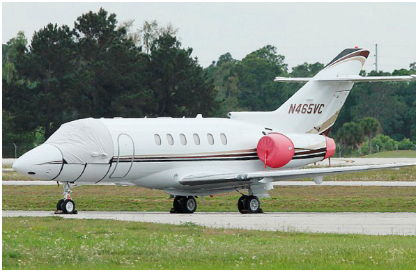
Hawker 800 Cockpit Cover and Engine Covers set