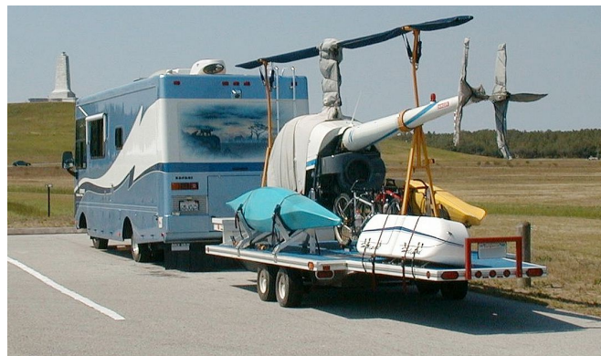
Robinson R-22 Bubble, Rotor Mast, Blades, Tail Rotor & Stabilizer Covers