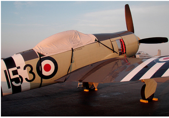
Sea Fury Canopy Cover & Exhaust Plugs