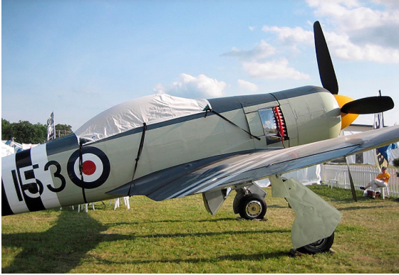
Hawker Sear Fury Canopy Cover & Exhaust Plugs

This cover type is made from Silver Acrylic Sunbrella canvas and is 100% lined with a soft and smooth microfiber. Bruce's Custom Covers developed this material combination especially for aircraft protection. The outer material is medium weight and treated for water resistance, UV resistance and anti-static buildup. The inner lining is a very soft and smooth microfiber to prevent scratching. The material is very reflective, and tests show that the cabin interior temperature can be reduced to near-ambient temperature on the hottest of days. It is water, ice and snow repellent, yet breathable to allow moisture to escape from between the cover and the aircraft surface.