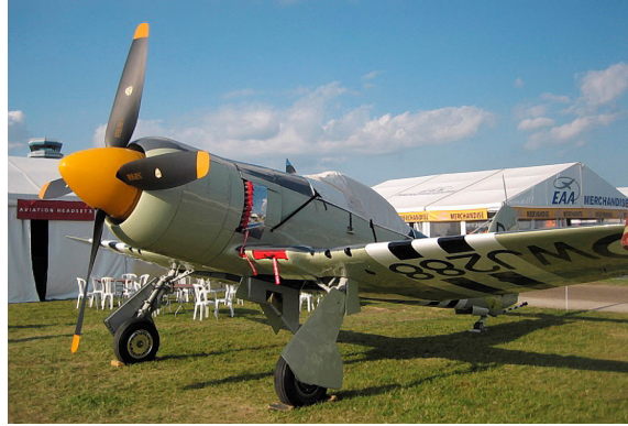
Hawker Sea Fury Canopy Cover, Exhaust Plugs, Wingroot Inlet Plugs