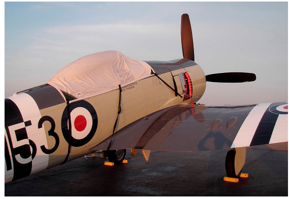
Sea Fury Canopy Cover & Exhaust Plugs