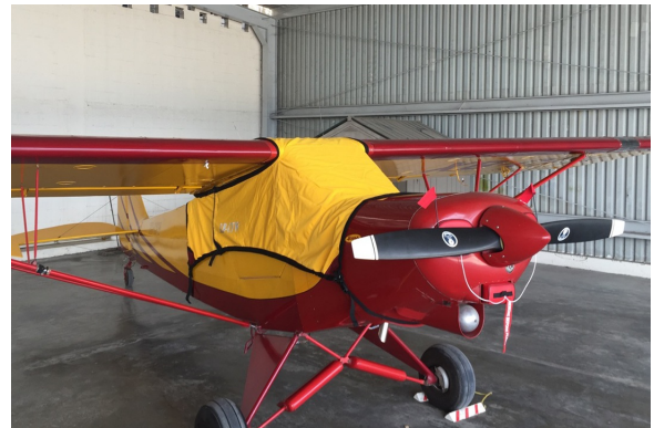
Piper Super Cub Canopy Cover, Engine Plugs