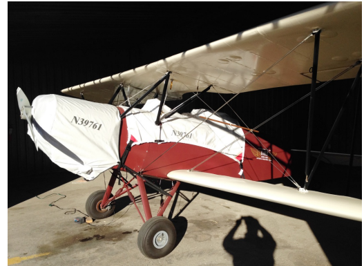
Hatz Biplane Canopy and Engine Covers