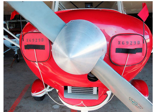
Piper PA-22-150 Engine Inlet Plugs (set of 3)