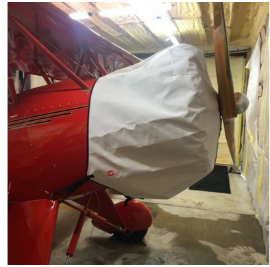
Hatz Biplane CB-1 Engine Cover